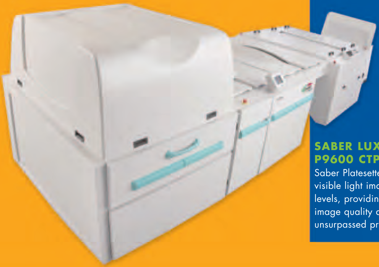
SABER LUXEL P9600 CTP Saber Platesetter takes visible light imaging to new levels, providing superior image quality at unsurpassed productivity.