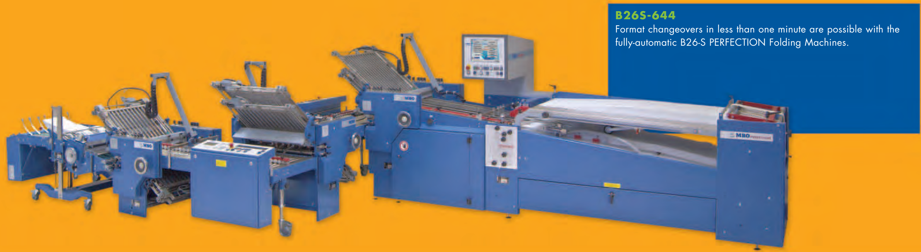
B26S-644 Format changeovers in less than one minute are possible with the fully-automatic B26-S PERFECTION Folding Machines.